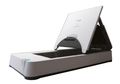
A4 Flatbed Scanner Unit 101